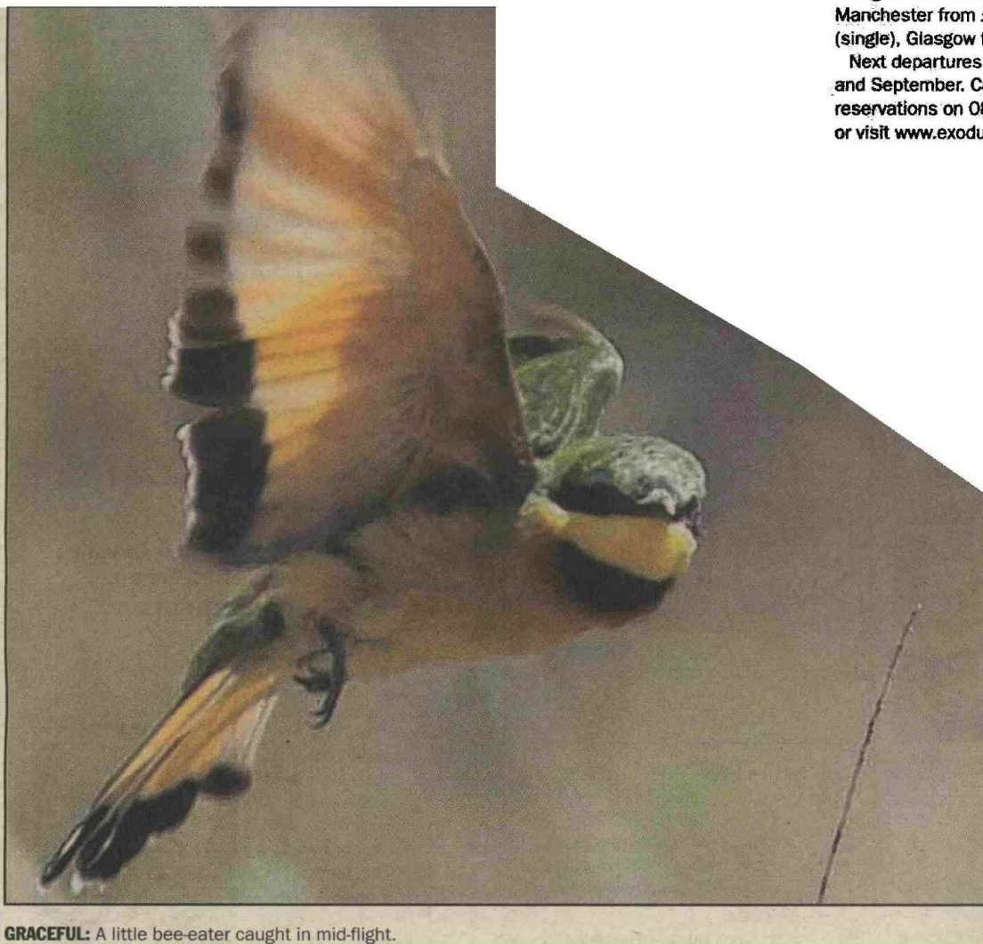
GRACEFUL: A little bee-eater caught in mid-flight.

Next departures are in June and September. Call Exodus reservations on 0845 863 9601 or visit www.exodus.co.uk .